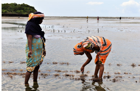
The group of women operating in seaweed farming in Mkwiro, Kwale County. 2021

Seaweed farming has been identified by AICS as a strategic sub-sector. Women in Shimoni and Kibuyuni form the highest proportion of seaweed farmers (75.2%), while youth and men contribute with 7.62% and 17.14% respectively. Income earned from the business give women the opportunity to contribute to the family decision-making process, representing an important tool to promote women empowerment and inclusion.