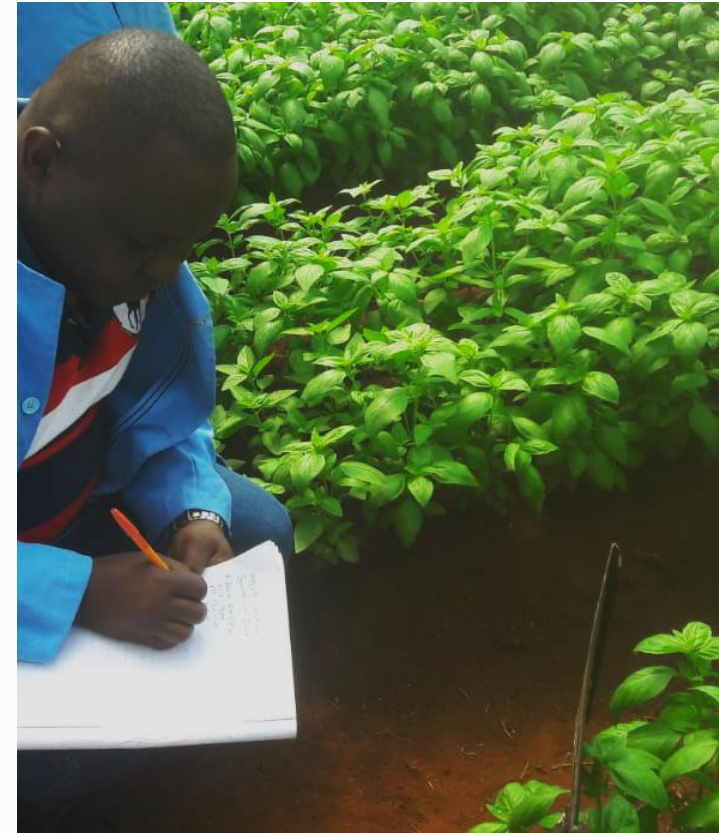
Close Crop Inspection and Management