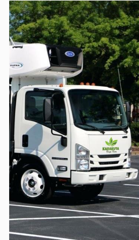
Dispatch to airport