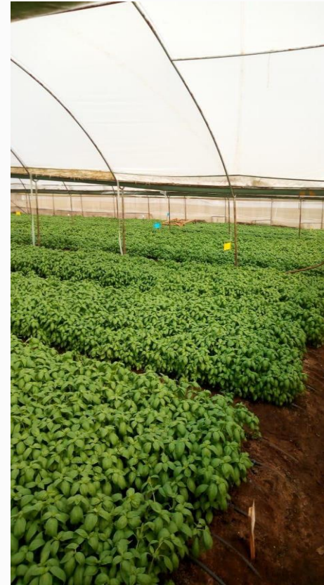
Indoor/ Greenhouse Plants